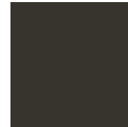
PBR Matte Bronze