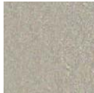
PMCG Metallic Champagne Gold